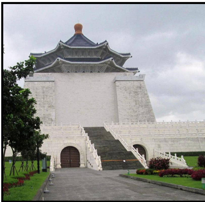
Above: The beautiful Chiang Kai-shek Memorial Park located in the centre of Taipei

My experiences of Taiwan were spectacular. It has broadened my view of the world and helped me understand the region better. I also started to learn Chinese while over there and plan to continue. I once thought it was an impossible language, but I have found that with some persistence that Chinese is very doable. I hope to return to Taiwan and to explore the region more. It is a fascinating part of the world and I would encourage everyone to go.