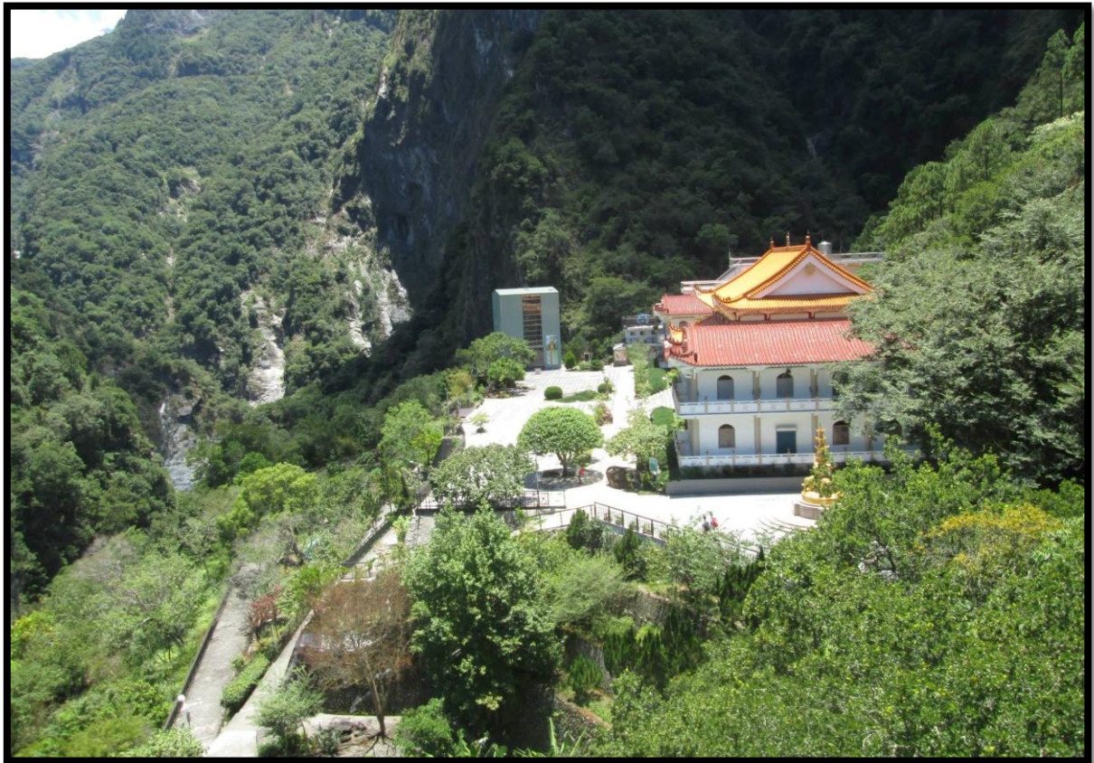
Above: A tourist hotel in Taroko Gorge, a spectacular region in Taiwan

I was always interested in Asia; I was fascinated by the vast, faraway continent around the world. As I read and learnt more I became very interested in the politics, culture and economy of Asia. But I didn't have any real on the ground knowledge of Asia or Taiwan, which I really wanted.