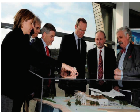
Minister Simon Coveney views model of proposed Beaufort Laboratory on a recent visit to NMCI