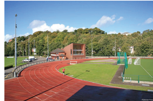
Mardyke Pavilion Extension

Two major projects have been completed in the Mardyke. The Arena has seen its third expansion since it was completed originally in 2001. New facilities include changing rooms, indoor sprint track, new fitness studios, hydrotherapy pool etc. The track will be replaced over the summer months. The historical Pavilion building has also been refurbished and expanded with additional changing rooms and a new function room.