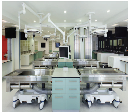
Dissection Lab Anatomy Dept in WGB.