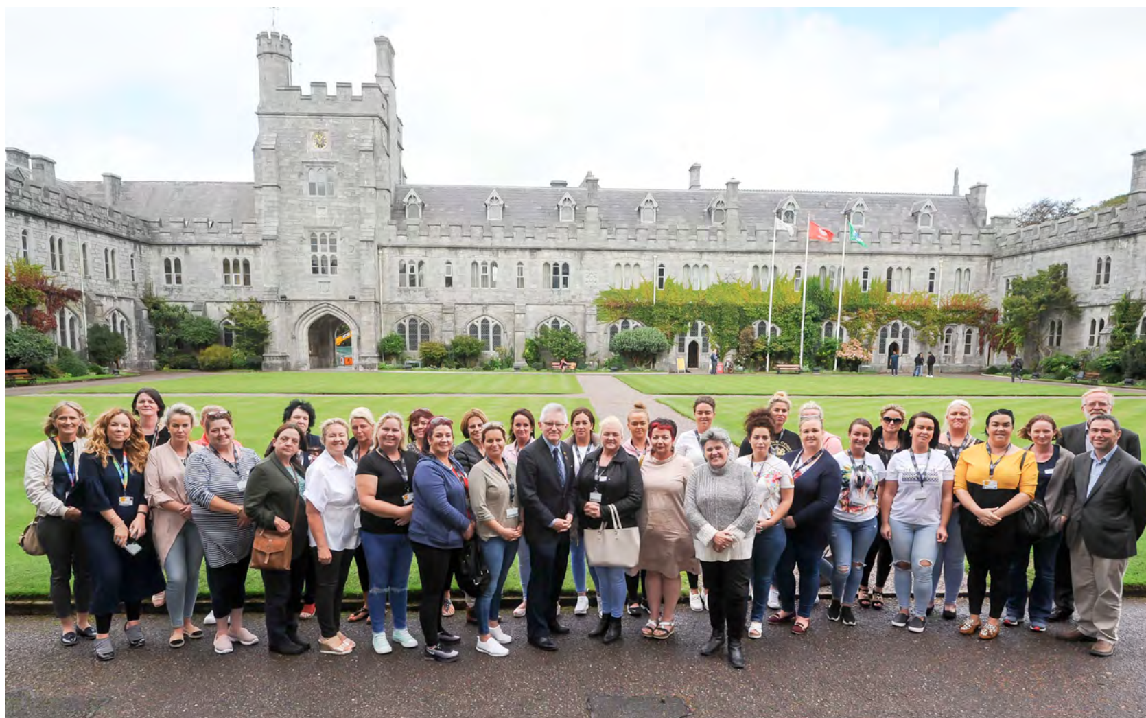
Above: Group starting Leadership in the Community Certificate.

On Wednesday the 4th of September UCC welcomed 27 traveller women onto an ACE Certificate in Leadership in the Community. This is a one-year Level 6 part-time ACE programme which is anchored in Applied Social Studies. This cohort of traveller women come from all around Cork and North Kerry. They will travel every Tuesday and Wednesday to attend their classes.