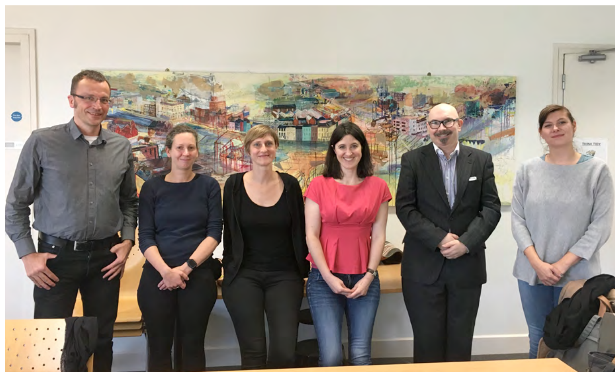
Above: CIRTl staff and colleagues from Humboldt University.