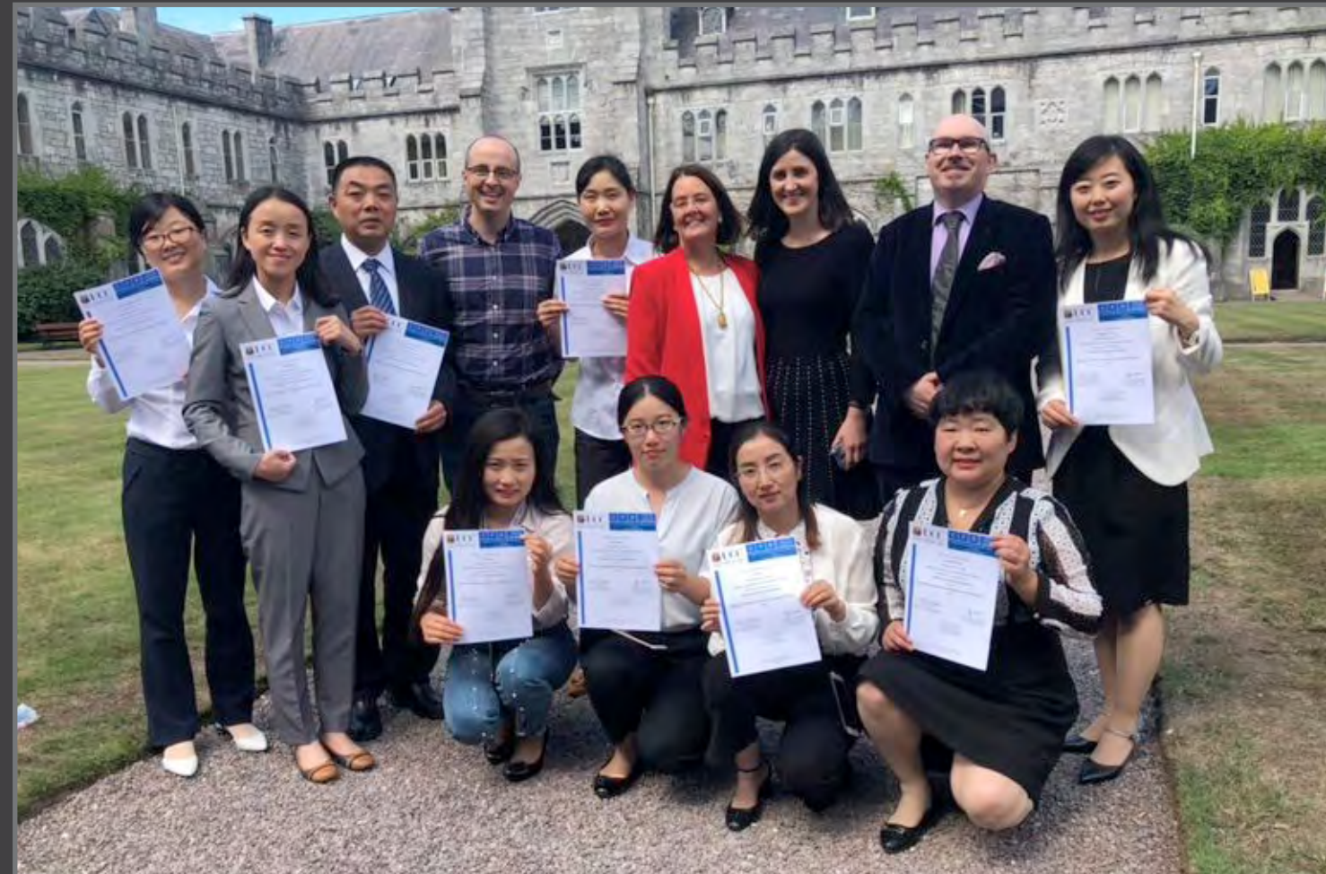
Continuing Professional Development