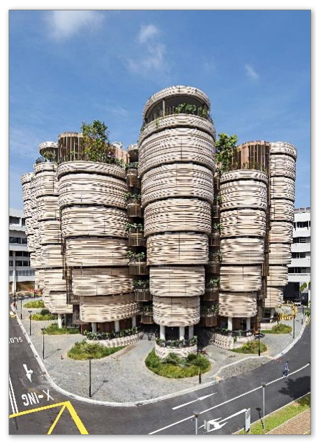
Learning Hub at Nanyang Technological University

An impressive example of a bespoke learning hub is one recently built at Nanvang Technological University (NTU) in Singapore which will open its doors to students in August 2015. The new Learning Hub stems from a simple idea: that people learn best from one another. By bringing students together in a university environment, they can collaborate to develop their thoughts further and faster than would be possible alone. This building will push the frontiers of innovation in learning and will serve a public university with 33,000 students. The learning hub at NTU houses 56 smart classrooms complete with flexible clustered seating for small group discussions, multiple LCD screens and wireless communication tools. Classrooms support the "flipped classroom" where knowledge transfer from teacher to students takes place before class through various online materials which students can access in their own time. Class time is then used for active engagement. Clustered seating is designed for students to discuss their ideas in small groups, before sharing and presenting their ideas with the rest of the class. This building was designed on the premise that in the information age, the most important commodity on a campus is social space to meet and to engage in collaborative learning.