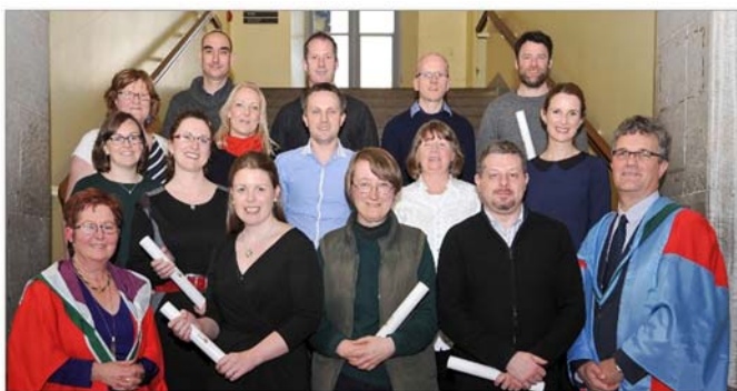
Some of the recipients of the Diploma of Teaching and Learning in Higher Education