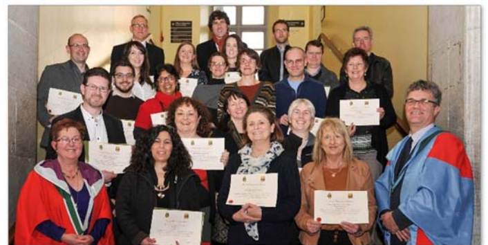
Some of the recipients of the Certificate of Teaching and Learning in Higher Education

On-going innovation is crucial to ensure that the learning and teaching which takes place in Irish universities is high quality, up-to-date, relevant, and delivered to students in a variety of suitable ways. Under Irish legislation (Universities Act 1997), each university is responsible for the quality of its own teaching and learning and for putting in place appropriate processes to ensure this. OVPTL is continuously engaged in ensuring that teaching and learning at UCC are delivered to the highest possible quality. In March we were delighted to host a celebratory event at which staff from all four Colleges of UCC received parchments in recognition of their attainment of Postgraduate Certificates and Diplomas in Teaching & Learning in Higher Education.