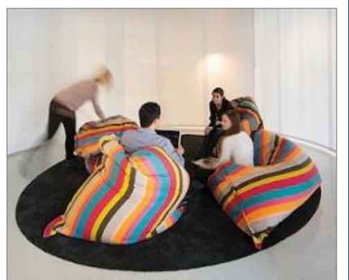
BVN Architecture's 'Learning Space of the Future' at Victoria University

Buildings & Estates and AVMS are now working with applicants to implement the successful projects.