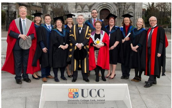
Recent graduates of the Masters in T&LHE

Twelve UCC staff were presented with a Masters in Teaching and Learning in Higher Education (MATLHE) at the Spring Conferring Ceremony on Wednesday, 22nd February. This brings to 76 the number of graduates of this Masters programme since its launch, most of whom are staff of UCC. This programme is one of three accredited courses delivered by OVPTL's Centre for the Integration of Research, Teaching and Learning (CIRTL) developed to deliver teaching qualification programmes to greater numbers of UCC staff. Seventy percent of the teaching staff at UCC now hold a qualification in Teaching and Learning in Higher Education, delivering on the third action of the 2013 – 2017 strategic plan. See www.ucc.ie/en/cirtl/ for details of the CIRTL team and staff professional development opportunities.